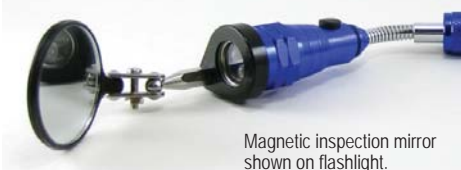
Magnetic inspection mirror shown on flashlight.